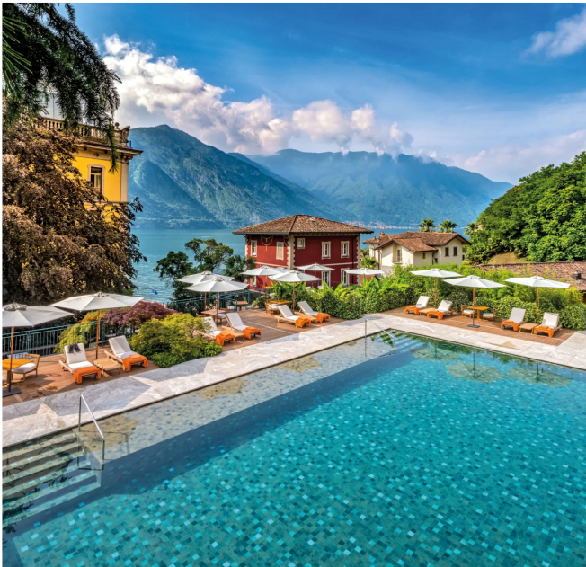
Grand Hotel Tremezzo, Lake Como tommypicone