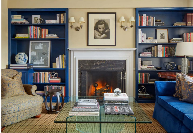
The living room of a suite at The Lowell Hotel The Lowell Hotel

The success of this collection of luxury lodges and resorts in South Africa—including The Silo in Cape Town, La Residence in the Cape Winelands, and the Royal Malewane safari lodge in Kruger National Park—is all due to owner Liz Biden. Impossibly stylish, she makes each guest feel like they're her closest friend. She has also personally designed each of her five properties, including curating their extensive art collections, which are comprised almost exclusively of contemporary art from southern Africa.