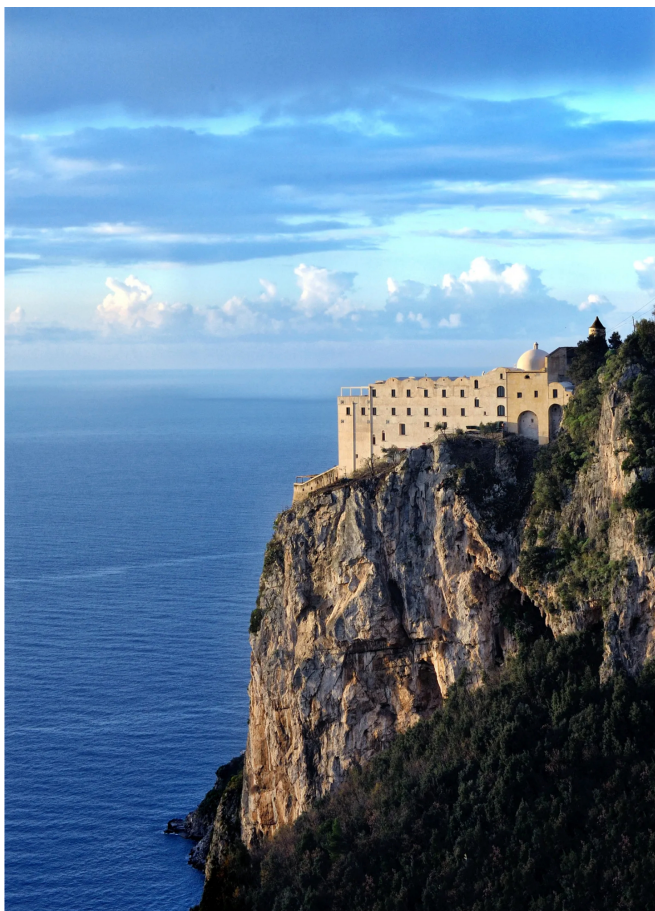
Monastero Santa Rosa Hotel & Spa on the Amalfi Coast