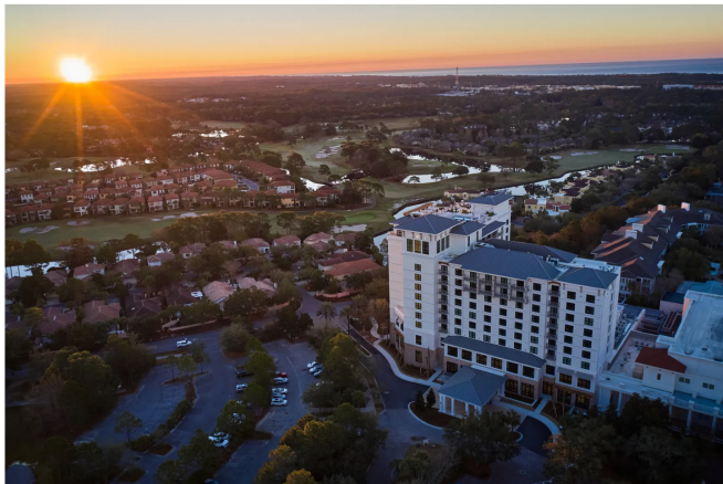
Hotel Effie on Florida's Gulf shores