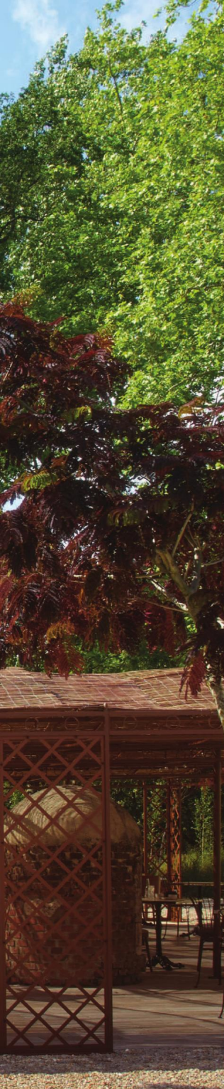
Above: Les Sources de Cheverny is surrounded by forests